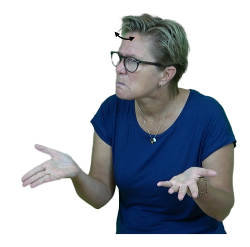
Figure 1: A tag with inquisitive headshake.

with headshake and, often, a particular mouth configuration where the lips are pressed together and the mouth corners are pulled down ('mouth frown', glossed as 'm.f'). Used in this construction, headshake appears not to express negation but rather functions to mark uncertainty, or to elicit a response, or both (for discussion, see Section 4.2). A tag with inquisitive headshake can follow both positive or neutrally marked sentence radicals (6 a) and negative sentence radicals (6 b). In the latter case, headshake accompanies both the sentence radical and the tag; usually, a brief interruption between the two instances of headshake can be observed.